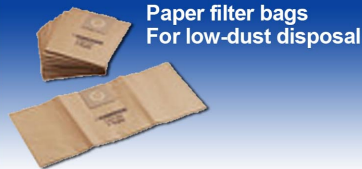
Paper filter bags For low-dust disposal